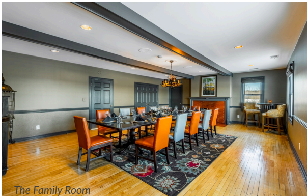
The Family Room

Rather than share a restaurant with strangers, opt for a private setting and custom catering at Destination Geneva National. Offering private spaces for any size rehearsal dinner. The memories are in the details.