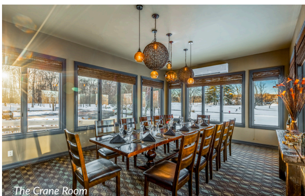
The Crane Room